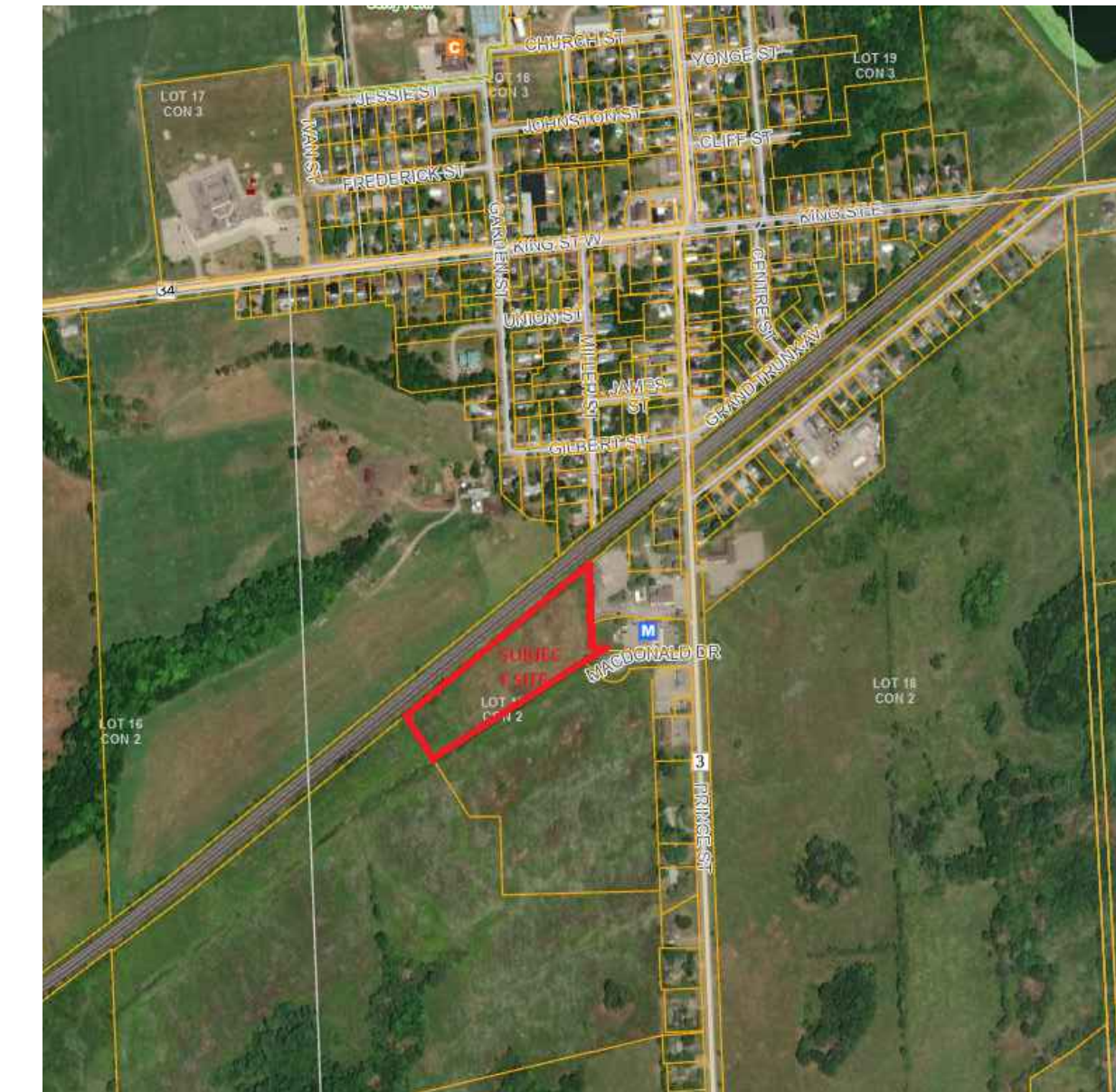
KEY PLAN NTS